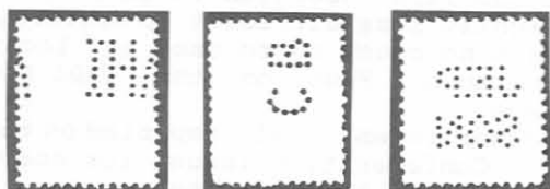
A.3 C.1 J.4