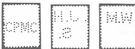
C.24 J.5 M.19