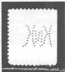
K47 KNAUTH MACHOD & KUHE