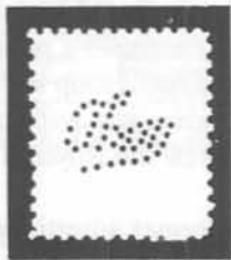
255 Thor products