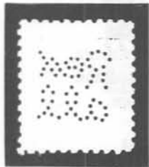
R58 REXALL DRUG

The earliest perfins designer had artistic talents as may be perceived from these early examples. Later patterns were plainer and not noted for their beauty. Unfortunately, the fragile tiny pin examples proved not to be practical and were soon discarded.