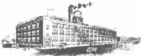
OFFICES & FACTORY - CHICAGO ILL. 36TH STREET & JASPER PLACE