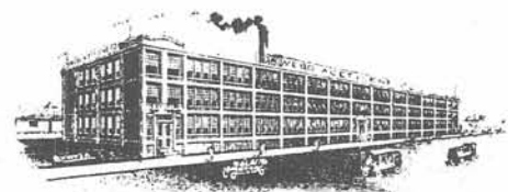
OFFICES & FACTORY - NEWARK, N. J. 646-680 FRELINGHUYSEN AVE