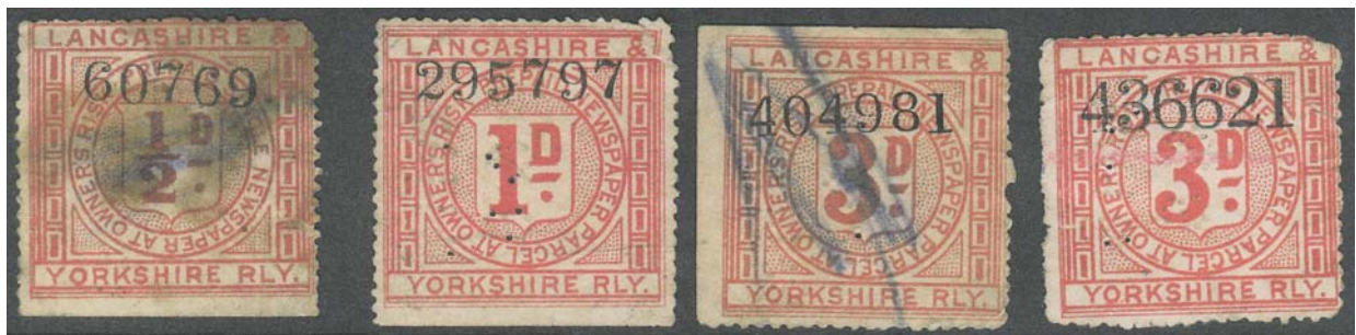
stamps reduced to 80%

Shown below are my four examples of newspaper stamps (½d, 1d and two 3d). These were issued by the LANCASHIRE & YORKSHIRE RAILWAY Company. All four stamps are printed in red.