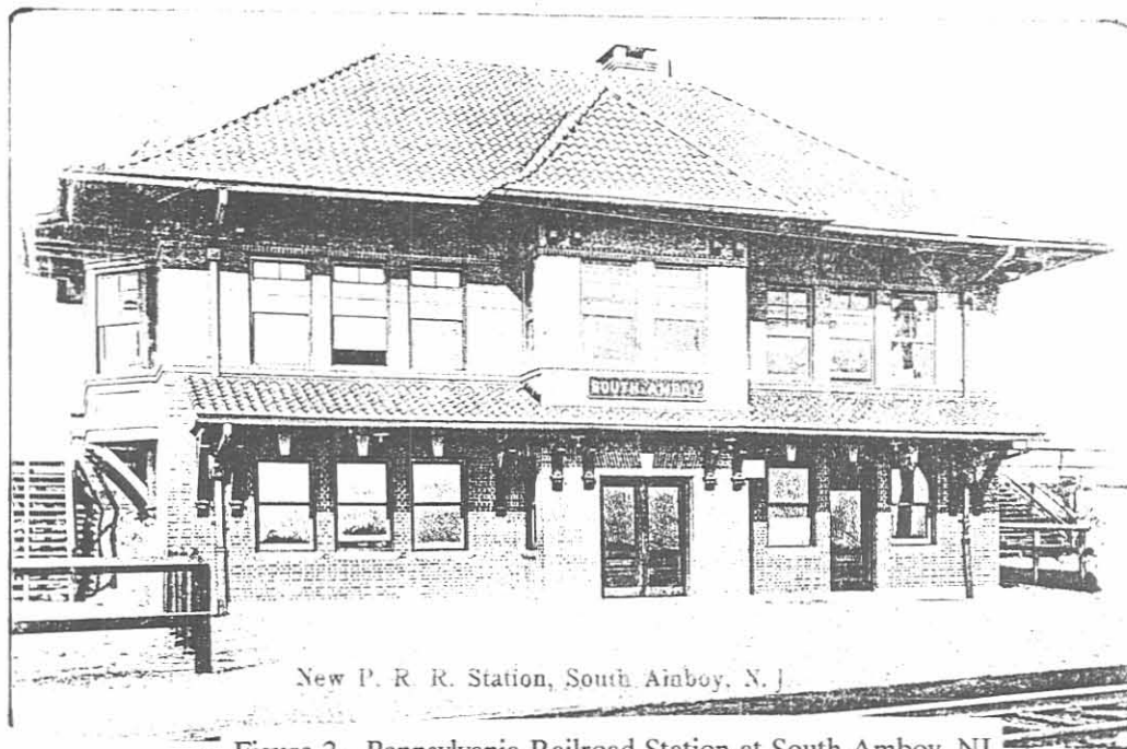
Figure 2 - Pennsylvania Railroad Station at South Amboy, NJ

Recently I received an auction catalog, and the first item that I noticed was a color photograph of Figure 1 on the outside cover. The fact that it was a perfin cover was immediately (to me) recognizable, and I quickly turned to the page where the lot was listed to see what the description was. Sure