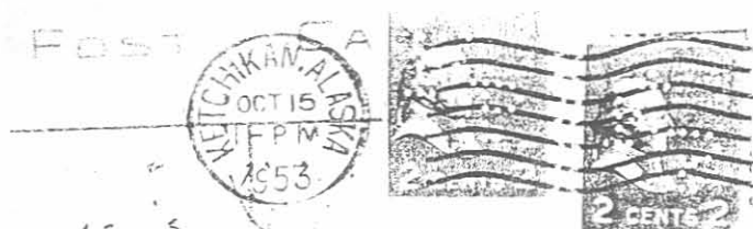
Figure 1 - Post Card's Stamps and Postmarks