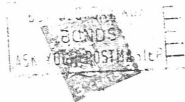
Figure 2 - Johnson Smith & Company - April 13, 1940

has a 3¢ Jefferson coil stamp. The corner card lists 6615 E. Jefferson Avenue, Detroit, Michigan as the company's address. The Detroit location is listed as a secondary location in the supplementary appendix of The Catalog of United States Perfins , Balough & Balough, 1979, The Perfins Club, Inc. Perfins on coil stamps, as you know, are not too common, on cover rare. I have a special collection of United States coil perfins. In time I will make a listing for publication.