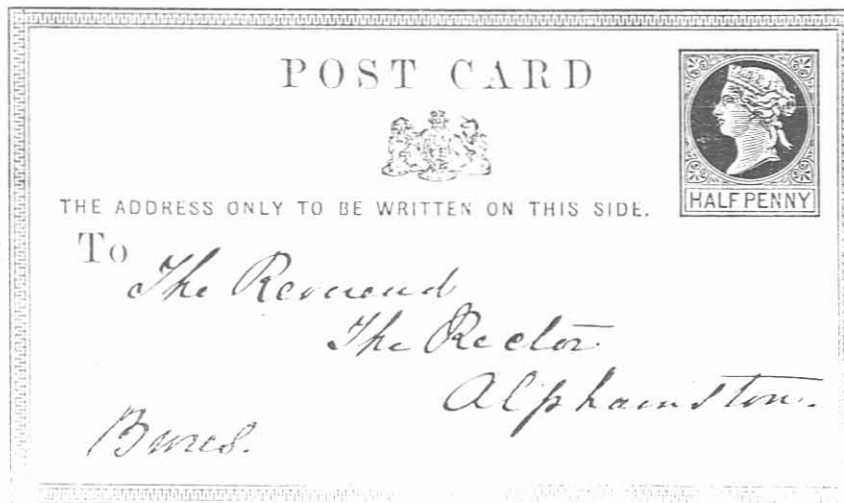
Manchester-Half-round cut cancel.