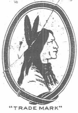
Figure 2 Billhead of Tuscarora Fertilizer Company