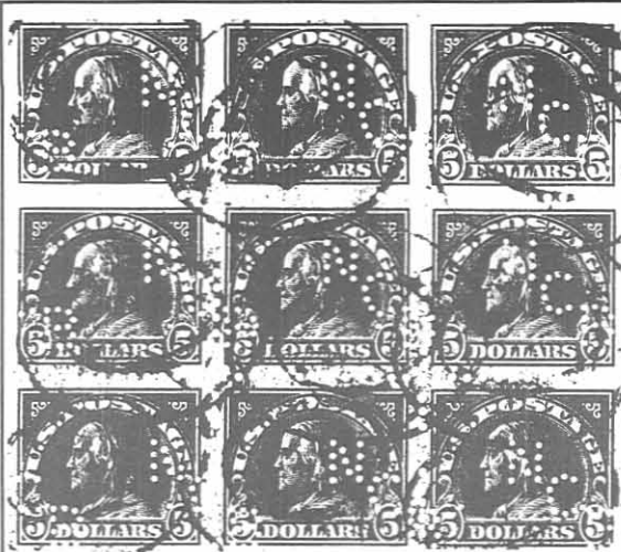
Figure 2 - Bob's Block of Nine

this one in the collection of Joe Laura, Jr. (#1238). Well Harry, perhaps there are not many blocks of four $5.00 stamps around, but how about this block of nine $5.00 (see Figures 2 and 3 to the right) punched with the "NCB" of New York's National City Bank. That is perfin pattern N44 which can be distinguished from pattern N43 by measuring the height of the letters -- 4.5 mm vs 4