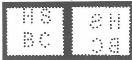
Figure 2, the narrow B