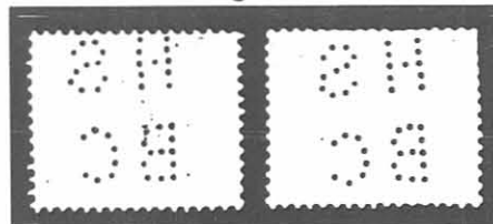
Figure 3, small holes & different shape of the B