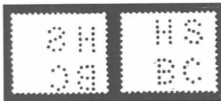
Figure 1, the wide B

Illustrated in Figure 4 are two different dies of the HS/BC perfin used in Amoy (overprinted CHINA). I cannot say for sure yet but there is a possibility that for this perfin the bank also has used