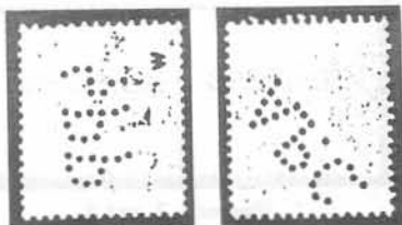
Figures 4 and 5, Left to right

(3) Figure 3 shows the straight line "specimen" perfin. This appears vertically on the 4, 7, 8, 13, 15 mil values and horizontally on the 250, 500 mil and 1 pound values (1942). The purpose of these "specimen" perfins was for identification to be distributed to the other member countries of the UPU.