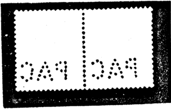
0120.03a 0120.03 Figure 5