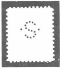
large holes New York

In some instances, matching holes were placed opposite each other.