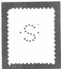
small holes New York

Branch office control identification for Swift & Company was a control hole(s) at the top, bottom, or sides of the letter "S".