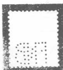
KANS. CITY MO F123