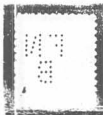
WILCOONA PA F128