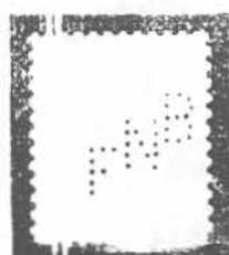
SAN ANTONIO TX F134