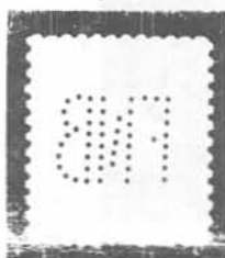
PORTLAND OR F124

There are 23 different First National Bank perfins listed in The Catalog of United States Perfins for FNB. Each is a different pattern. Some, really do look alike until fitted onto the catalog picture.