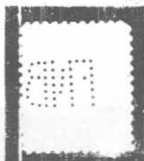
UNKNOWN CA F122

The F124 and F126 patterns may look alike; however F124 has 5 diagonal holes in the letter "N" and F126 has 6 holes diagonally.,