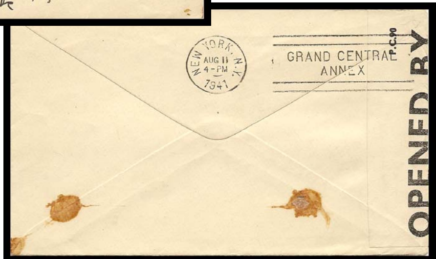
Figure 2 Back of Censored Cover Note: New York Forwarding Postmark of "Aug 11 1941" is only one day after the "Time and Date" Mark