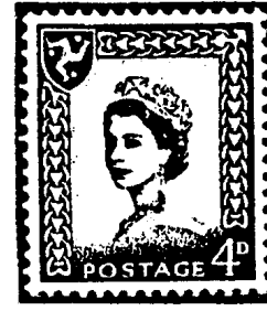
Isle of Man