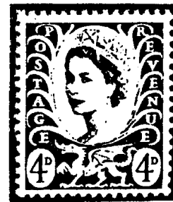
Wales & Mon.

A list of perfins on G.B. Regionals reported to me over the years is shown on the next two pages. This list is not exhaustive, and additional perfins, issues, values, and dates are very much welcomed. Those identified with known users have been marked with an asterisk. As is to be expected, there is usually a link between the user and the particular Regional issue reported used.