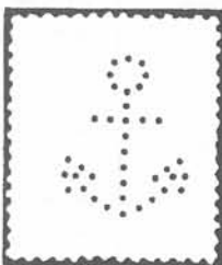
Anchor pattern of Japanese Navy appeared on many issues.

In Japan, the anchor was a widely recognized and almost sacred emblem of the Im-