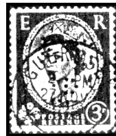
Post World War II British stamp