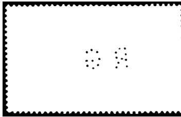
Jersey Bailiwick stamp