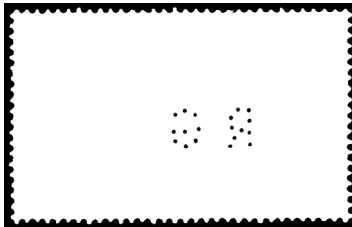
Guernsey Bailiwick stamp