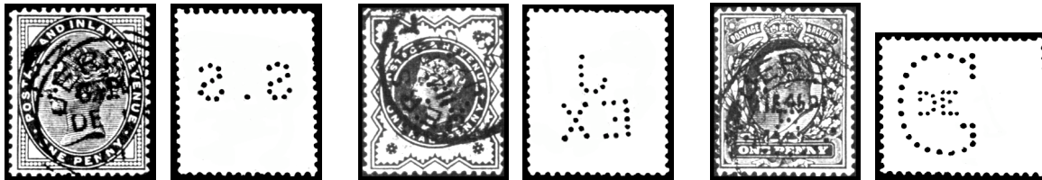
Pre World War II British stamps – ‘Jersey’ cancel