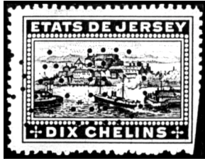
Etats de Jersey