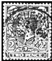
Pre World War II British stamp