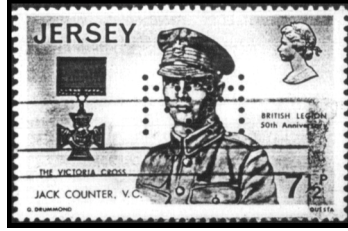
Jersey regional stamp