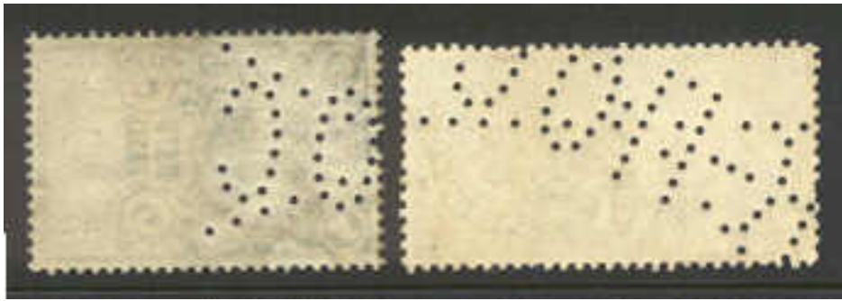
Figure 7: Perfin K.P.O.S.

The perfin K.P.O.S. (see Figure 7), was used by the court of justice in the district of Kamenets Podolsk. In Tsarist Russia, Kamenets Podolsk was the center of the province of Podolskaya. Nowadays it is a town in the district of Khmel'nitsky in the republic of Ukraine. The perfin also exist on revenues (tax stamps) of Ukraine. An example is shown in figure 8.