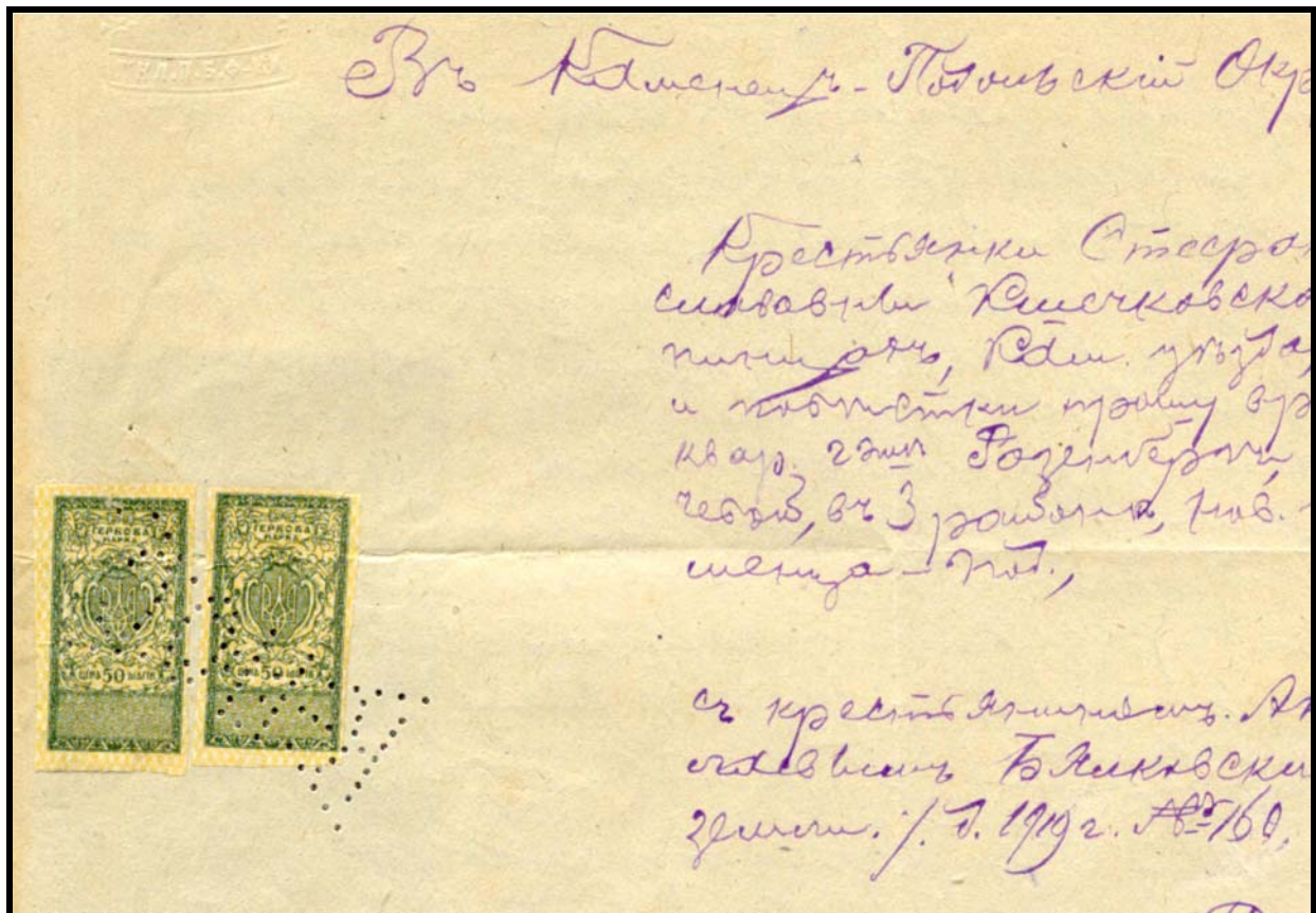
Figure 8: part of a document with the (Ukrainian) perfin K.P.O.S.

The perfin K.P.O.S. (see Figure 7), was used by the court of justice in the district of Kamenets Podolsk. In Tsarist Russia, Kamenets Podolsk was the center of the province of Podolskaya. Nowadays it is a town in the district of Khmel'nitsky in the republic of Ukraine. The perfin also exist on revenues (tax stamps) of Ukraine. An example is shown in figure 8.