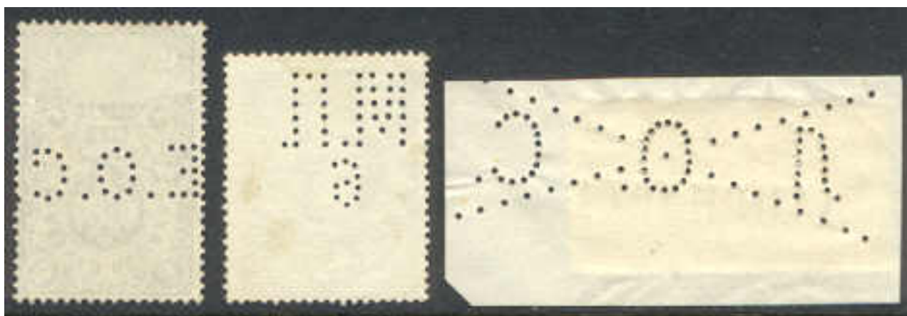
Fig. 1: various forms of official Russian perfins.

The official governmental Russian perfins form part of a still almost unknown collecting area. No catalogue of these perfins is available. With this article I want to start a survey of the official perfins found on Russian revenue stamps. As a start and for the time being I'm limiting myself to one type of official perfins, which can be called " initials on cross ".