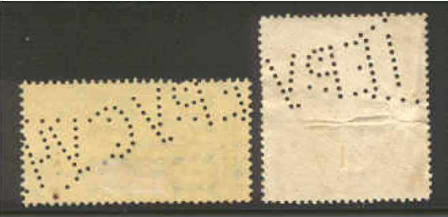
Figure 6: Perfin I E R U S Uch

Figure 6 shows a perfin I E R U S Uch, which has the very early Cyrillic character 'I' which I have never seen in another perfin. The character 'I' could also be a part of "H" or "N" but on the stamp no blind perfs of other initials are to be seen. We are waiting for information concerning the user.