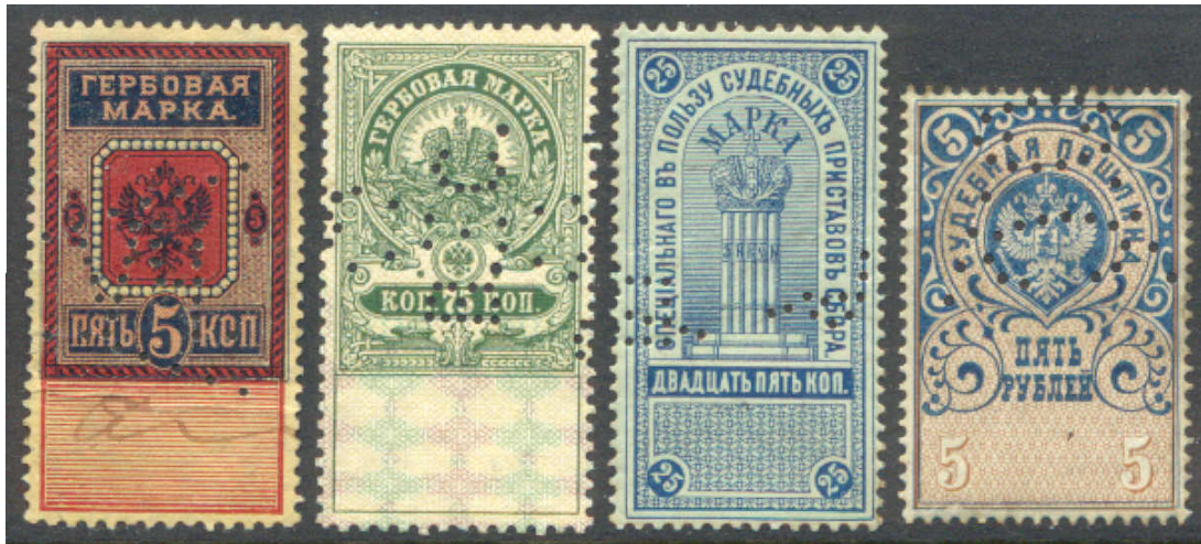
Fig. 2: various Russian revenue stamps with official perfins.

The perfins of this type can be found on a large number of different revenue stamps. Figure 2 shows some often found stamps. For those who are interested in a complete survey of Russian revenue stamps I call attention to the publication “Russian revenues” by J. Barefoot (2004).