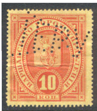
Fig. 3: revenue stamp of the town of Warsaw

The first two stamps on Figure 2 are tax-stamps of 5 kopeks (1887) and 75 kopeks (1907). The other two stamps are intended for use by judicial authorities: 25 kopeks and 5 roubles (1891).