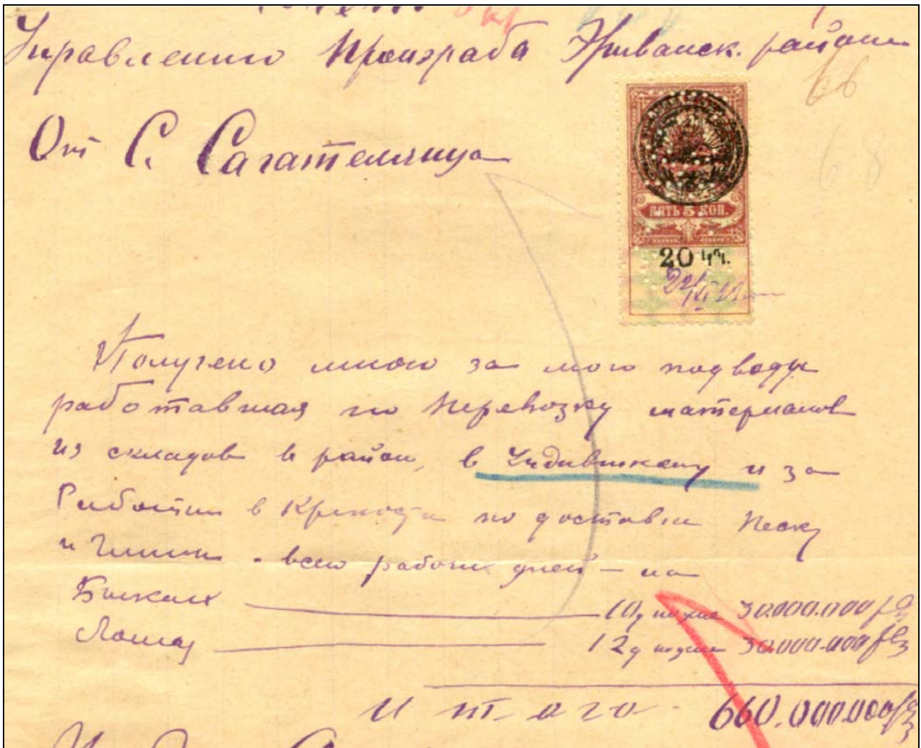
Figure 5: part of a document with perfin E.K.P.