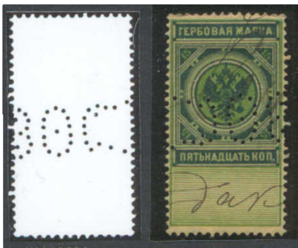
Fig. 19: Perfin V O S (type 1)

The perfin S O B O . . . (fig. 18) I have only found on a 10 kopeks tax-stamp of Warsaw. The two lines cross exactly in the middle of the second letter “O” so it is nearly certain that 3 characters of the illustrated perfin are missing. -Does anyone have a perfin with the remaining characters ?