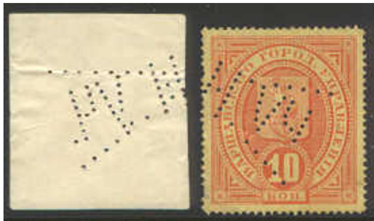
Figure 14: Perfin . . N Uch.

In view of the position of the letter “N” in between the crossing lines of the perfin . . N Uch (fig. 14), it looks like only two characters of this perfin are missing. This perfin is also found on municipal tax stamps of Warsaw.