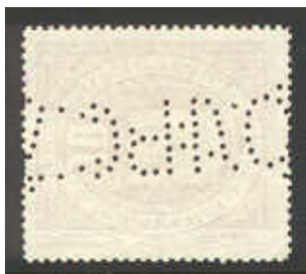
Figure 15: Perfin . O L S Uch.