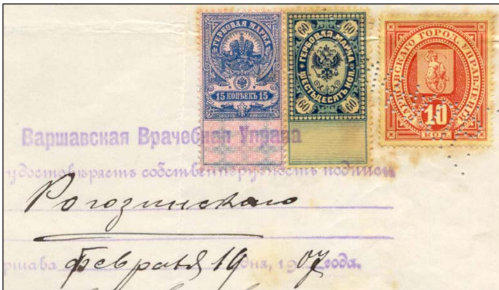
Fig. 22: part of a document with the perfin VRACH UPR. of the Medical Administration in Warsaw. (reduced illustration)

The perfin is found in general Russian tax-stamps as well as in stamps for municipal taxes of Warsaw.