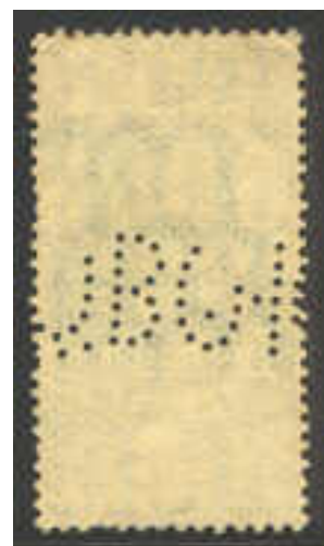
Figure 16: Perfin OVON.

Also the perfin . O L S Uch (fig. 15) is found in tax-stamps of the town of Warsaw. I suppose that one character is missing in the illustrated perfin. Is anyone in possession of a stamp with the first part of this perfin ?