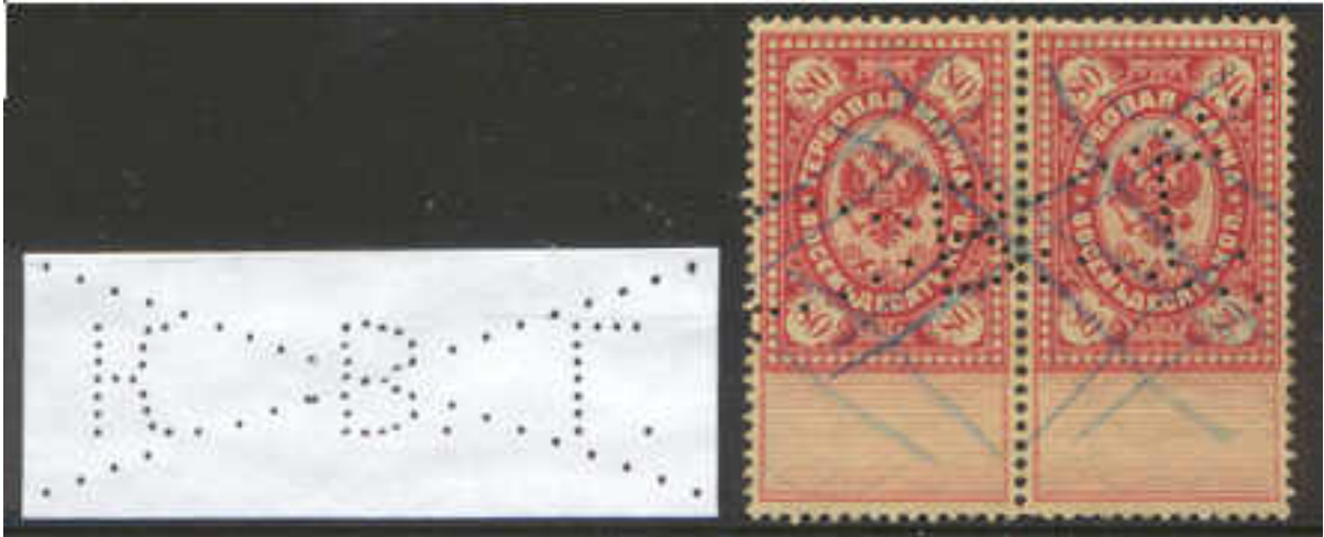
Figure 9: Perfin K.V.G.

The perfin K.V.G. is until now the only Russian perfin in revenues ending with the letter G. This perfin may have been used by an organ of the Russian province (Gubernya)? I have seen this perfin on tax stamps issued in 1887 and 1907.