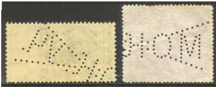
Figure 12: Perfin M O K Uch.

The perfin M O K Uch is likely to have been used by a registration office of a district organization in the Polish town of Warsaw. I have this perfin both in common Russian tax-stamps (1887) and in stamps for municipal taxes of Warsaw. For the time being I assume that the letter “O” stands for Okrug (district) and the “K” for Kontora (office).