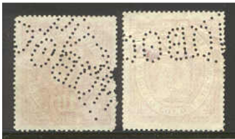
Figure 13: Perfin N O V O S Uch.

The perfin M O K Uch is likely to have been used by a registration office of a district organization in the Polish town of Warsaw. I have this perfin both in common Russian tax-stamps (1887) and in stamps for municipal taxes of Warsaw. For the time being I assume that the letter “O” stands for Okrug (district) and the “K” for Kontora (office).