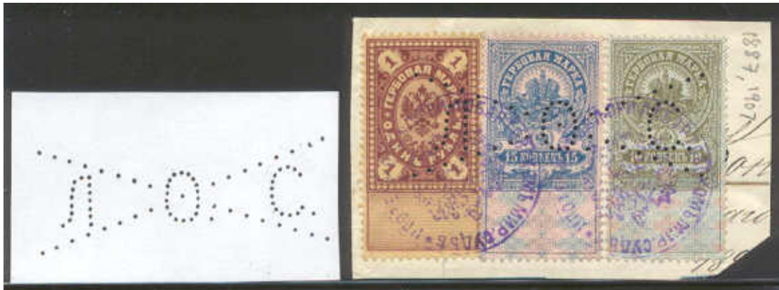
Figure 11: Perfin L.O.S.