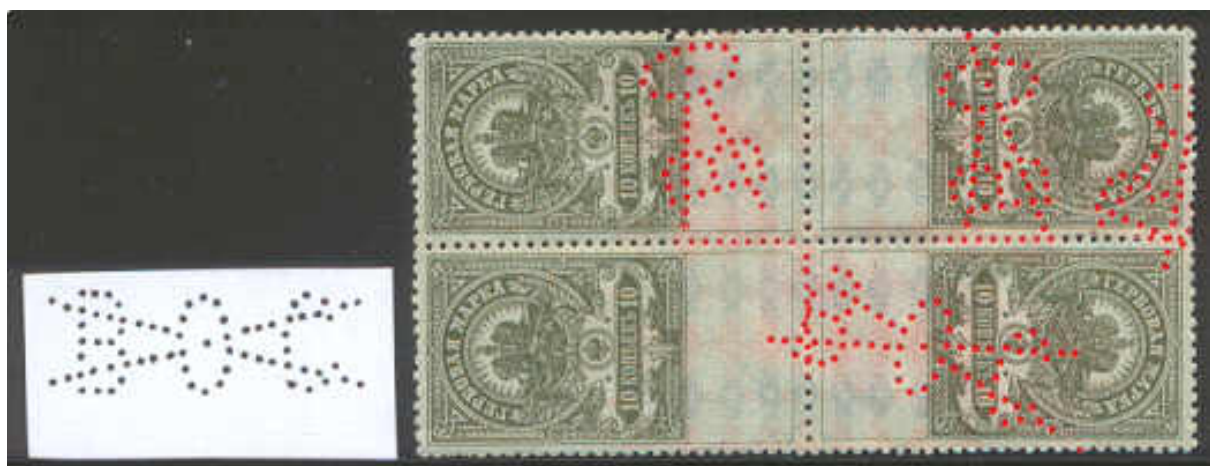
Figure 20: Perfin V O S (type 2) – reduced illustration

The perfin V O S (fig 19/20) is found in two types. Type 1 has 3 letters close together and there are no perfin holes in between the letters. Type 2 (see fig. 20) shows more space between the letters and also parts of perforated crosslines are visible in between the letters. The perfin V O S (type 1) I have on tax-stamps of 1887/ 1888. The perfin was used by the court of justice of the Vologda district.