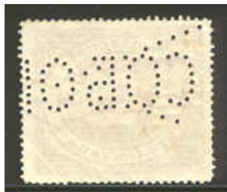
Fig. 18: Perfin S O B O . . . .

The perfin S O B O . . . (fig. 18) I have only found on a 10 kopeks tax-stamp of Warsaw. The two lines cross exactly in the middle of the second letter “O” so it is nearly certain that 3 characters of the illustrated perfin are missing. -Does anyone have a perfin with the remaining characters ?