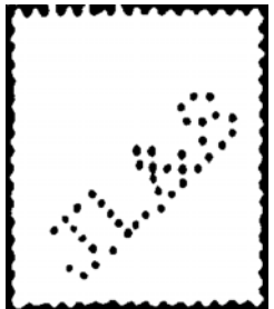
J5010.01 1935-1945 Newcastle