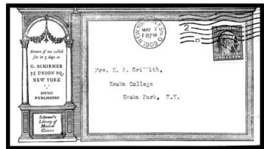
Pattern G166 – GS/NY – D rate Gustav Schirmer Incorporated [Music Publisher] NEW YORK, N.Y. STA. O – May 7, 1909