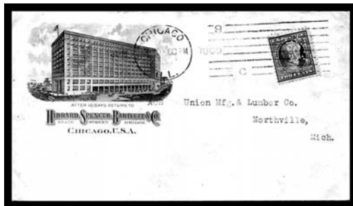
Pattern H172 – HSB/Co – C rate Hibbard, Spencer, Barlett & Company CHICAGO, ILL – June 3, 1909