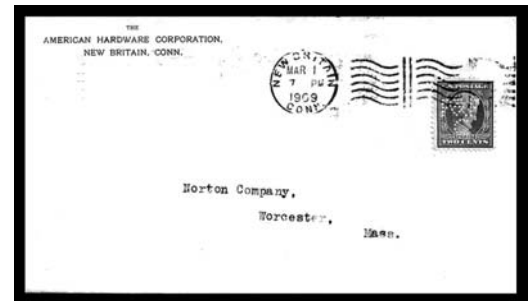
Pattern P252 – P&F/C – C rate The American Hardware Corporation NEW BRITAIN, CONN – March 1, 1909