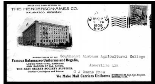
Pattern H14 – HA/Co – C rate The Henderson-Ames Company KALAMAZOO, MICH. – March 18, 1909