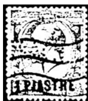
Pattern: BA CL