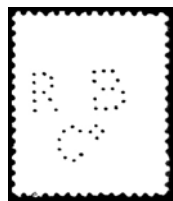
Pattern: RB/C (Back)