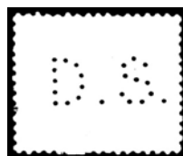
Pattern: DS (Back)