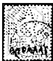
Pattern: A/B&Co (London Cancel)