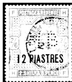
Pattern: MB (Front) (Lombardy, Italy (?) Cancel)