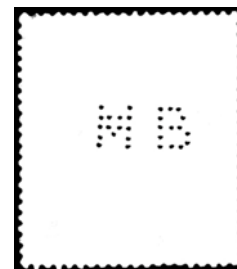
Pattern: MB (Back)