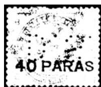
Pattern: DS (Front)