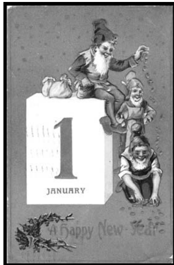
Colorful Front of New Year's Greeting Card

A search of the World Wide Web shows that S. Langsdorf & Co. were publishers of picture postcards on a very wide range of subjects starting in the early 1900's. (It appears they are not in business today.) Their cards are highly prized by postcard collectors, with many of them listed in the popular Internet auctions.