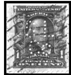
Stamp Cropped from Card (Shown 120% of Actual Size for Clarity)