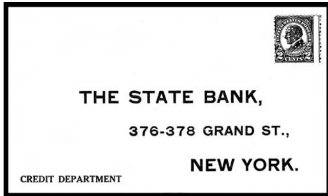
Unused Cover with Pattern T97A (Size reduced to 50% of actual size)

Wow, what a fun hobby we perfin collectors have!