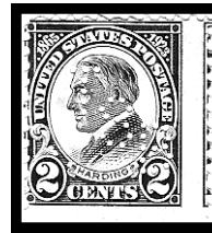
Stamp cropped from cover (Actual size)