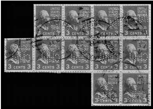
Front of Block of 11 (Reduced to 60% of actual size)

A common but interesting interest item it is! A cursory look at any blocks of perfin that you may possess might give the collecting community more interesting information. Hurry up and get out that box of perfins and take another look!