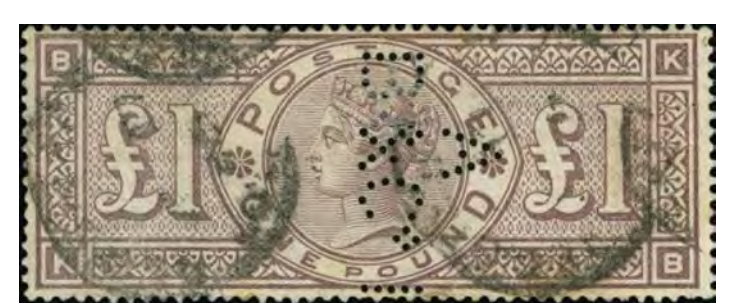
A. Biedermann & Co, 4 Angel Court, Bank, London EC