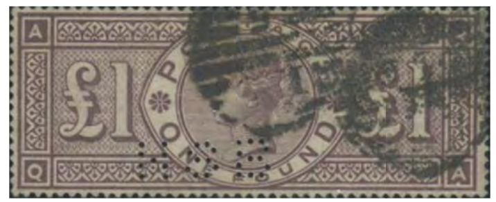
Hong Kong & Shanghai Banking Corporation, 31 Lombard St, London EC