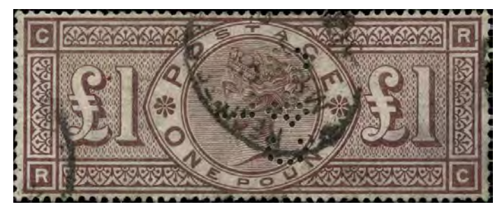
Louis Cohen & Sons, 59 Threadneedle St, London EC