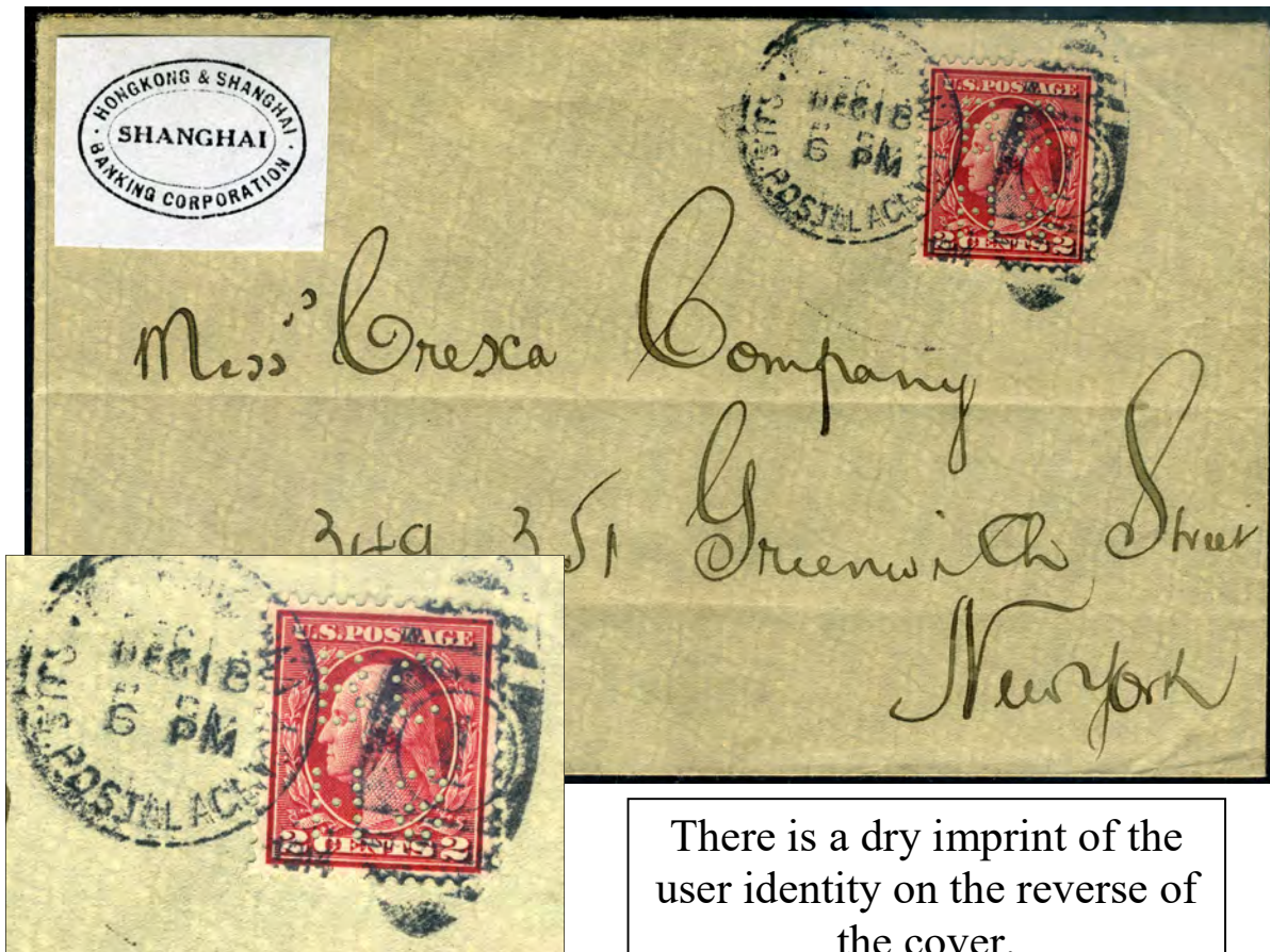
There is a dry imprint of the user identity on the reverse of the cover.

The perfin on this cover is: ‘H S / B C’ and the user is the Hongkong & Shanghai Banking Corporation in Shanghai.