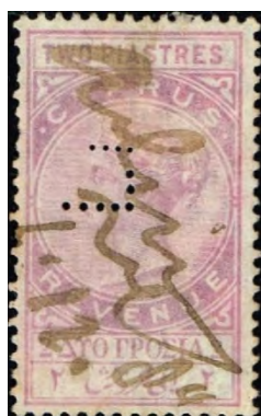
2 Piastres "LI" - Limassol