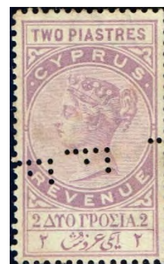
2 Piastres "F" - Famagusta