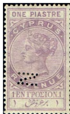
1 Piastre "N" - Nicosia