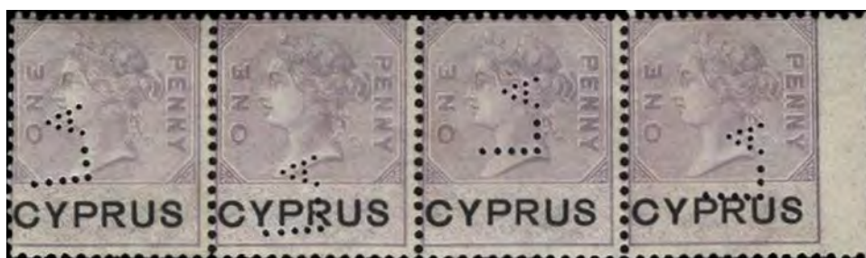
Figure 5 Mint strip of four 1d Lilac/Black with “LA” Larnaca perfin

Lastly shown below in figure 5 is a mint strip of four of the 1d un-appropriated die with the Larnaca “LA” perfin. This strip is particularly interesting as the random strikes on the four stamps clearly shows that this was a single headed die machine. Looking back at the Famagusta “F” perfin in figure 2, the multiple strikes again show a single headed die.