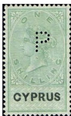
1/- Green/Black "P" - Paphos