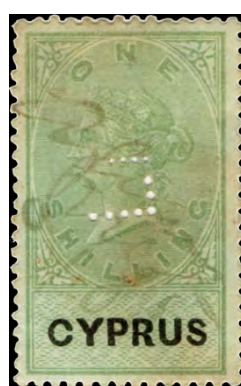
1/- Green/Black "LI" - Limassol