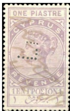
1 Piastre "LI" - Limassol