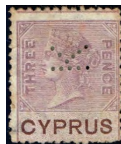
1d Lilac/Black "K" - Kyrenia