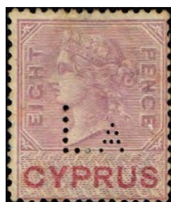
8d Lilac/Carmine "LA" - Larnaca

Following the establishment of British administration of Cyprus on 12 July 1878, a series of the GB un-appropriated Die stamps was overprinted 'CYPRUS' to be used for revenue purposes. From early 1879 these revenue stamps used by the administration at Larnaca and other centres were cancelled with perfins (Figure 1). Subsequently the Cyprus Queen Victoria tri-lingual revenue stamps issued in 1882 and denominated in Turkish Piastres were also cancelled with the same perfins. (Figure 2)