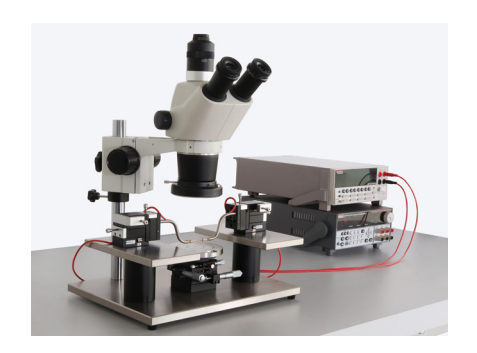
BIV SET UP

Low profile design, steel base, rigid and stable.