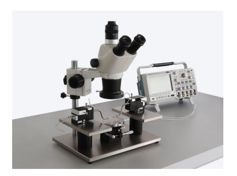
COAX SET UP