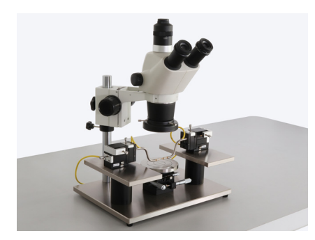
TRIAX SET UP