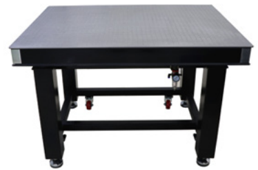
Frequency and transmissibility - Table Top Compact Vibration Isolation Table