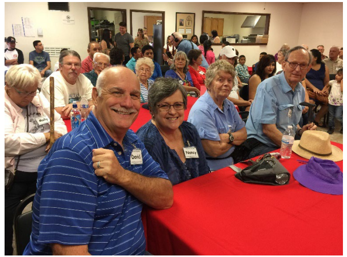
The Vista Visitors to Agua Prieta