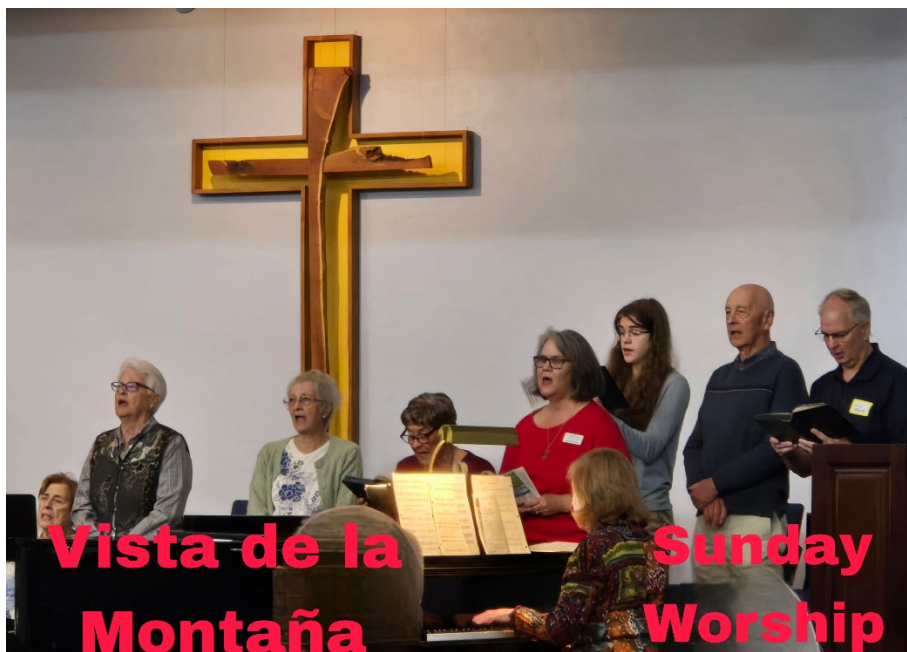
Our AMAZING Choir!!!