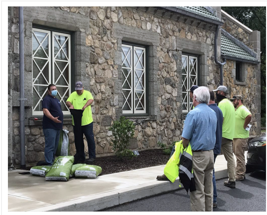
Biochar Training by Princeton Hydro for local DPW personnel.

Biochar is a woody, organic material that attracts a variety of pollutants including phosphorus. Biochar was placed in large "socks" and tethered along beaches and inlet areas. This product has been shown to remove dissolved phosphorus directly from nearshore waters in turn limiting algal growth. The absorbed phosphorus is contained within the product and won't leach back out. Biochar is a relatively low-cost option for phosphorus removal and has the added benefit of being usable as compost once its capacity to absorb phosphorus is exhausted.