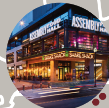
Fifth + Broadway