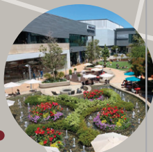
Hillsdale Shopping Center