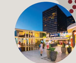
Westfield Century City