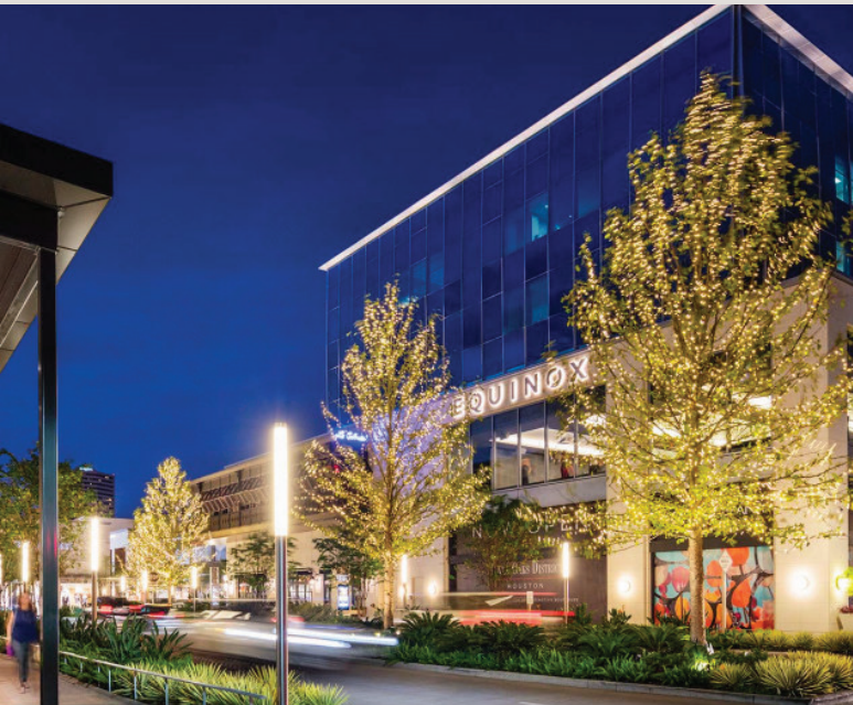
River Oaks District, Houston