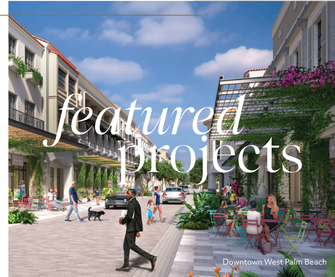
Downtown West Palm Beach