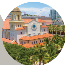
Downtown West Palm Beach