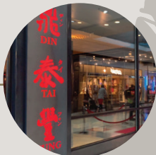
Din Tai Fung