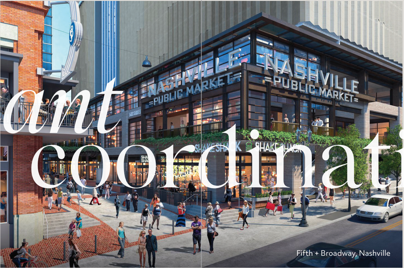
Fifth + Broadway, Nashville

Using industry-best practices and leading-edge tools, we streamline communication, reduce risk, and enhance accountability.