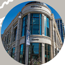
Shops at Buckhead