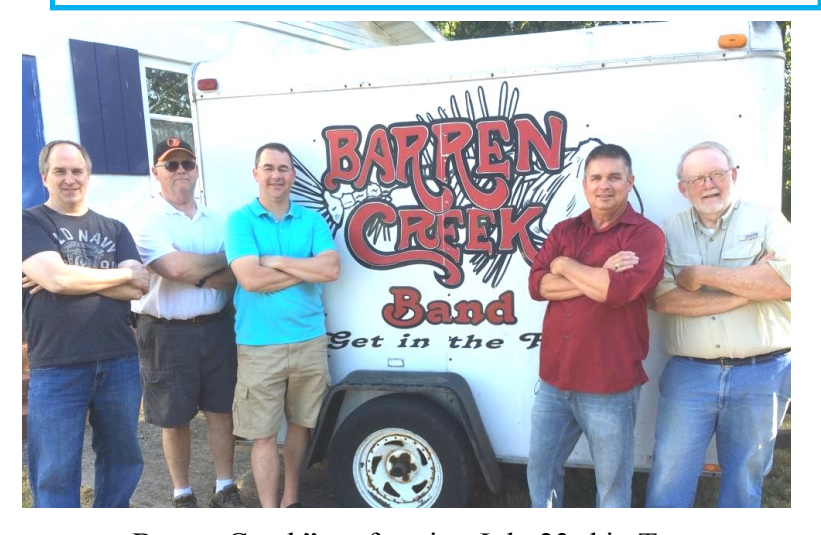
"Barren Creek" performing July 23rd in Trappe

"Put on your calendar to attend the Talbot County Fair July 6-9! Lots of fun activities for the family! Visit <a href="http://www.talbotcountyfair.org">http://www.talbotcountyfair.org</a> for more information & schedule! Come support local Trappe 4-H members!"