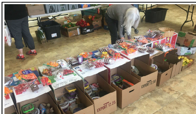
Filling 29 boxes takes organization.

On the third Monday of each month, Food Pantry volunteers assemble and ship 29 food boxes to the three villages across Kachemak Bay. A special thanks to Smoky Bay Air who transports the three pallets of food boxes to Seldovia, Port Graham and Nanwalek at no cost to the Food Pantry. Thanks to support like that, the Food Pantry can better utilize resources to bring more nutrition to more of our friends and neighbors.