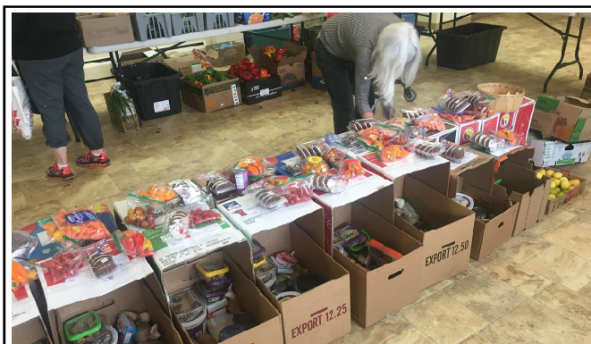
Filling 29 boxes takes organization.

On the third Monday of each month, Food Pantry volunteers assemble and ship 29 food boxes to the three villages across Kachemak Bay. A special thanks to Smoky Bay Air who transports the three pallets of food boxes to Seldovia, Port Graham and Nanwalek at no cost to the Food Pantry. Thanks to support like that, the Food Pantry can better utilize resources to bring more nutrition to more of our friends and neighbors.