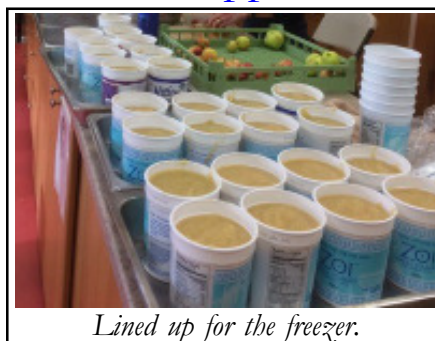
Lined up for the freezer.

A brief discussion via email determined the best use would be to