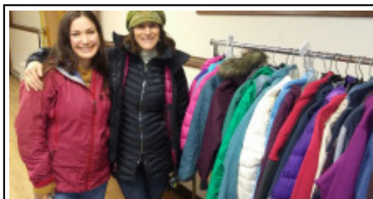
The Homer's Jeans team and the rack of donated coats.

It's even better when the organizers deliver the coats to the Food Pantry two weeks before Christmas. They even thought to bring their own display