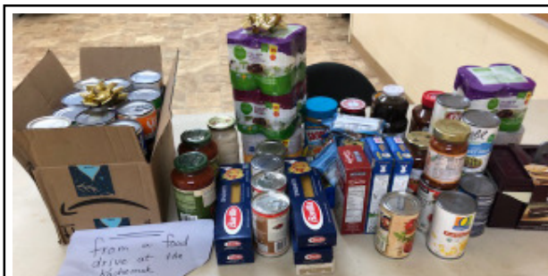
A table full of donations from the Kachemak Bay Campus.

The list of Homer organizations providing food donations is humbling. And, the season of giving saw that list grow even more. Among the local food drives were the Kachemak Bay Campus, and McNeil Canyon and Homer Middle Schools. Other organizations included the Homer Hockey Association, Community Christian Church, and South Peninsula Hospital.