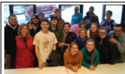
The team assembled for a photo.

Students, from as far away as Sutton, Palmer, Anchorage and points south, were put to task