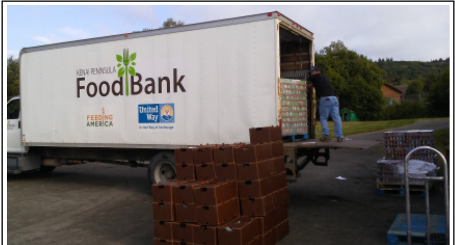
The monumental task of unloading the Kenai Food Bank's truck the last Monday in June.

It is extremely gratifying to be part of a comprehensive network designed to share the best in meeting the nutritional needs of our community.