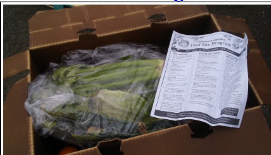
Each Farms to Families Produce Box comes with a sheet of recipes.

As part of the Coronavirus Food Assistance Program, Secretary Perdue announced back on April 17th of this year, that the USDA is exercising authority under the Families First Coronavirus Response Act to purchase and distribute agricultural products to those in need.