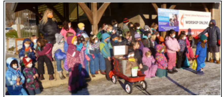
45 Little Fireweed students assemble at the Food Pantry.

The students from the Little Fireweed Academy spent several weeks conducting a food drive and wanted to make the presentation of the collected donation the Friday before Thanksgiving.