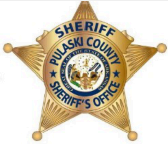
exhibit n. mis represented information, False Arrest, maco+fal000005+42val

Thank you for visiting our information portal. The functionality of this portal is currently under development. Please select "Inmates" to view a current roster of individuals housed in our facility. Additional court assignment and bond information can currently be found in the "Reports" section of this portal.