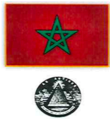
exhibit a2. failure to appear ; amended on 08/11/2021