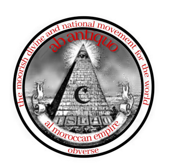
exhibit a2, amended on 05/14/21