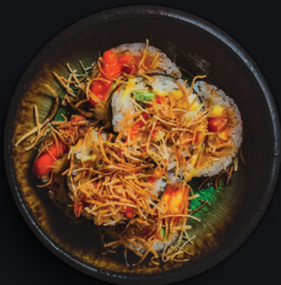
Tiger Roll (6pcs) £9.50

Salmon, tuna, white fish, shell fish, avocado topped with crispy leek