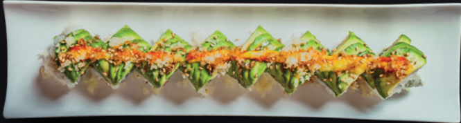
Choi - Marillo Roll (V) £8.50

Asparagus & shiso topped with avocado amarillo & sesame