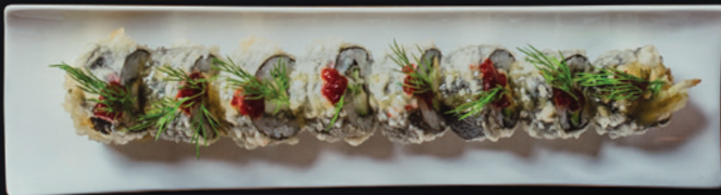
Crispy Jungle Roll (V) £10.90

Deep fried tempura roll with asparagus, avocado and cucumber, top with dill & cranberry jam