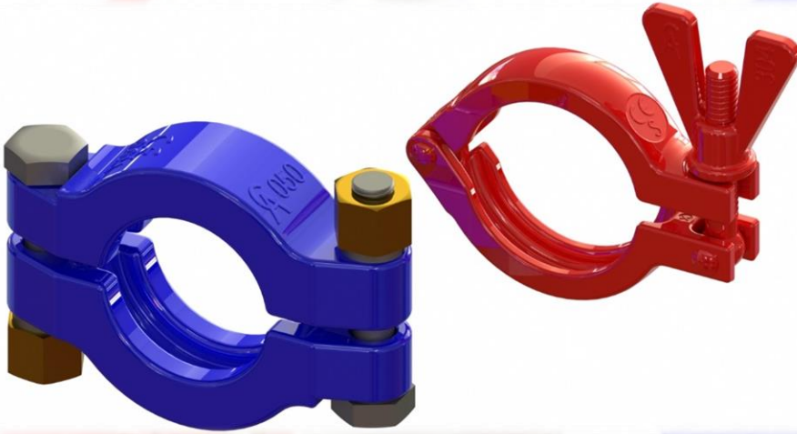
HARD WEARING COLOUR CODED CLAMPS BY ACL