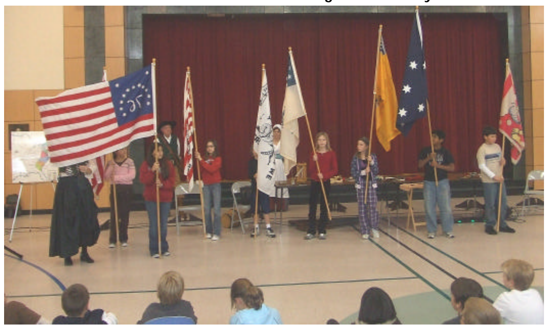
Period flags were displayed and described.