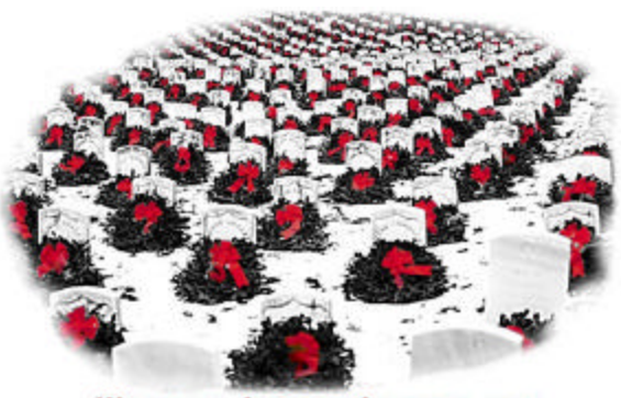
WREATHS-ACROSS-AMERICA.O. REMEMBER - HONOR - TEACH

There was no publicity. No crowds gathered. The gesture was one man's private duty, born of a trip to Washington he won as a 12-year-old paperboy. Of all the monuments and memorials he