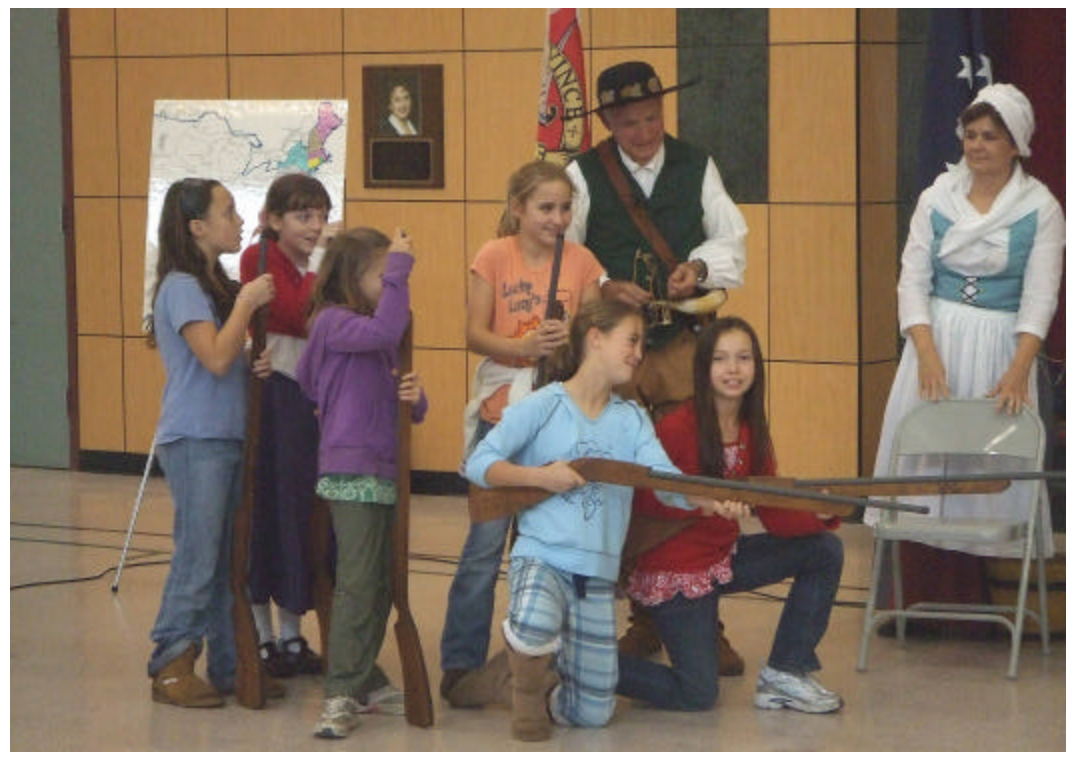
A mock battle was fought between the Colonists (the girls) and the Red Coats (the boys). We are happy to report that the Colonists won!!